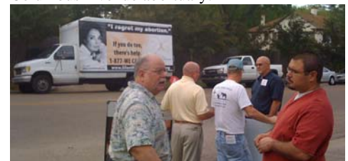
“Carolyn” at the abortuary. In the billboard message actress Jennifer O’Neill proclaims “I regret my abortion.”

“Carolyn” is driven out to send powerful pro-life message at each monthly Second Sunday gathering, to each monthly Life Chain, and each Thursday morning when Planned Parenthood inflicts surgical abortions at its 1927 Columbus Avenue abortuary.