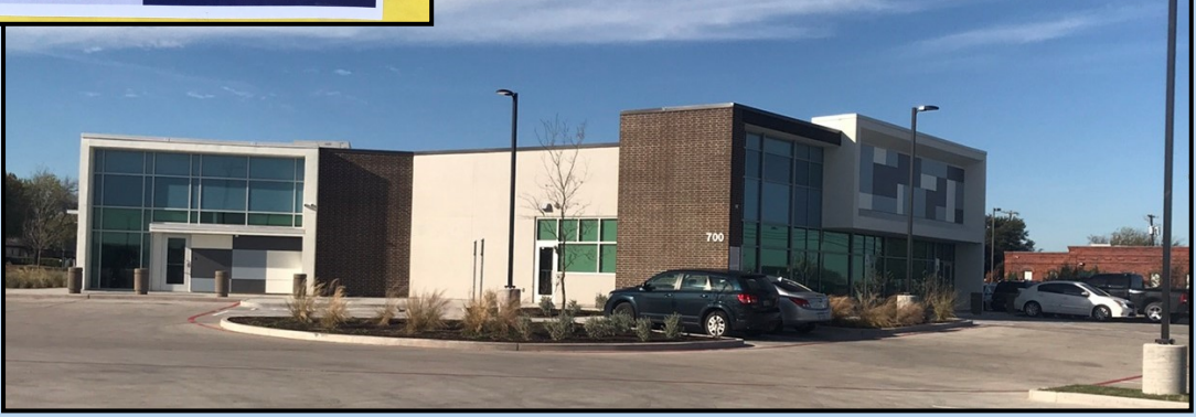
The mask is now off! Nov 20 was the first day of operation for the new Planned Parenthood facility at 700 W HWY 6. Abortions will be committed at the wing to the left.