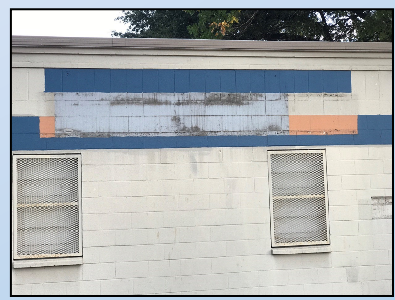
Planned Parenthood tore its sign off the exterior wall.