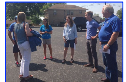
Let's head south on Interstate 35!

Planned Parenthood Waco's abortion facility is closed. Most likely, this would not have happened in 2013 without the leadership in Austin to enact the HB2 pro-life law. We did our part by putting on our blue shirts and carpooling to Austin to help show that Texans Stand4Life. I got so excited about this legislative battle that I entered the Twitter world as @wacoprolifer.